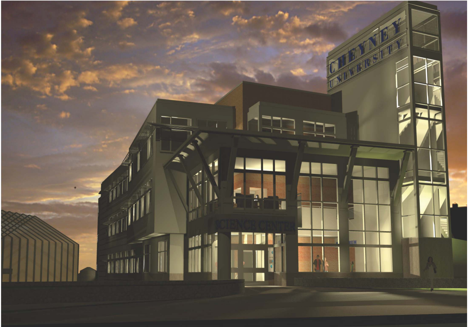
Cheyney University New Science Center Cheyney, PA 19319