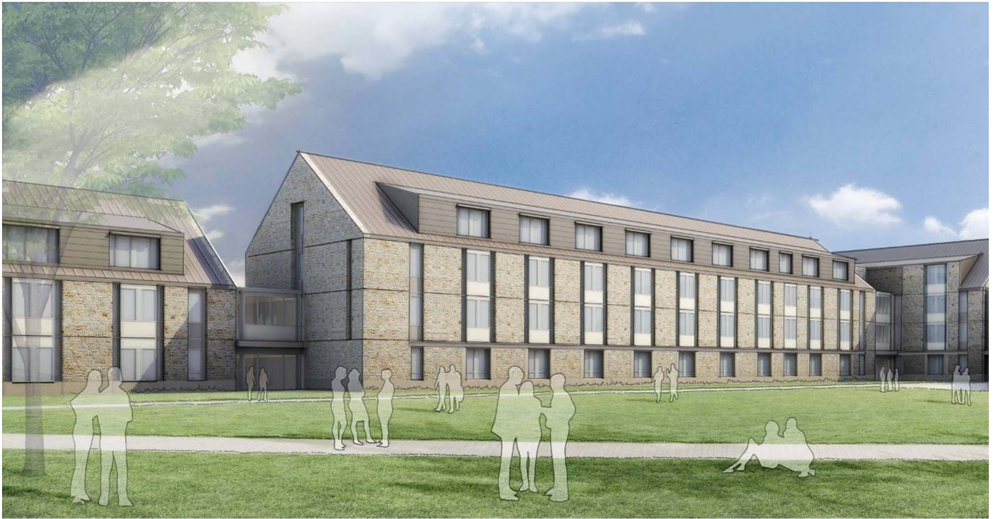
VIEW AT ACTIVE QUAD