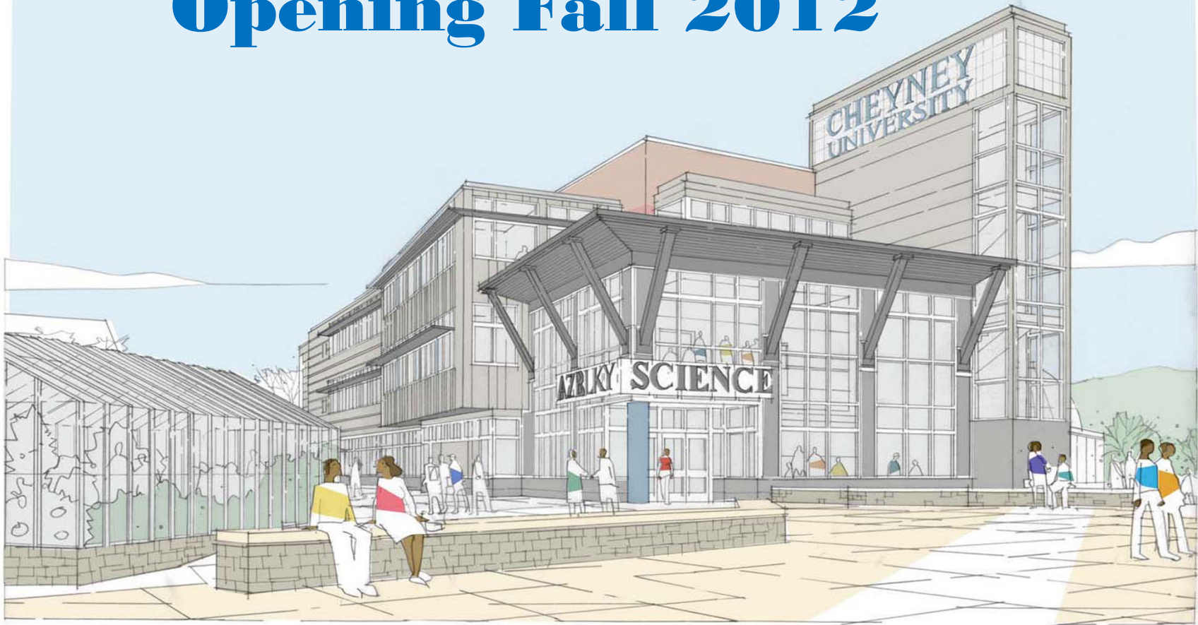
NEW SCIENCE BUILDING CHEYNEY UNIVERSITY